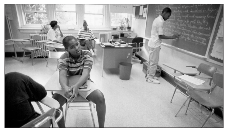
Dreamers' Classroom, 1991