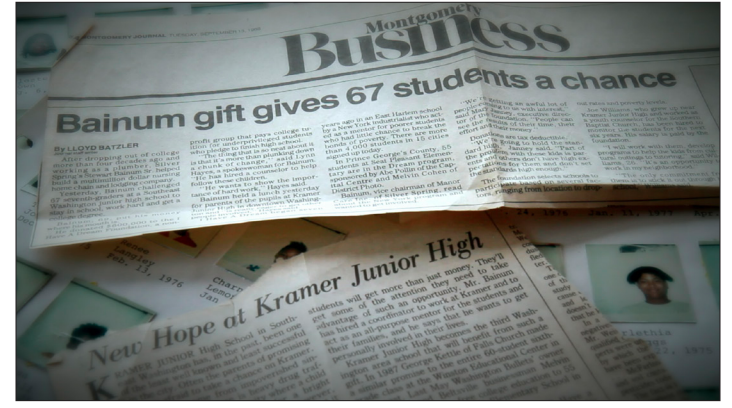
Press Coverage, 1988 Credit: Betsy Cox